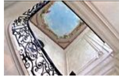
Inside a Luxury $45 Million Paris Mansion Q