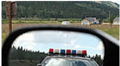
(Oct 2013) - If You Drive 35 mi/day Or Less