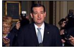
Ted Cruz on Senate Deal and Opposition to Obamacare Q