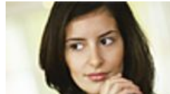
Nine Comments That Could Get You Fired