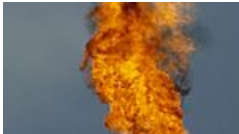
$20 Trillion Dollar Oil Find Could Unseat