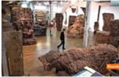
Sculptor Ursula von Rydingsvard on Motivation, Art Q