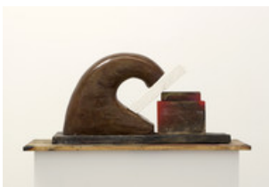
"Overlapping Figures" a bronze, plaster and wood sculpture by Camille Henrot, a young French artist who won a Silver Lion award at the 2013 Venice Biennale. The

The 304 international exhibitors at the 44th edition of Art Basel will have raised expectations, following the $1.1 billion of sales at contemporary auctions in New York last month.