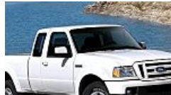
8 Awesome Discontinued Cars That