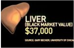
Cash on Hand: The Price of Body Parts Q