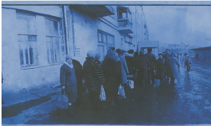
At Dusk, 1993 (Boris Mikhailov)

One of the leading photographers of the former Soviet Union is showing 40 years of work in New York City.