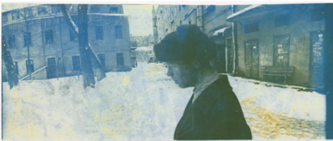
Boris Mikhailov. At Dusk (Series), 1993–2000. One of a series of 110 photographs, gelatin silver prints, blue hand toned, each 5 1/8 x 11 3/4 inches (13 x 29.5 cm).