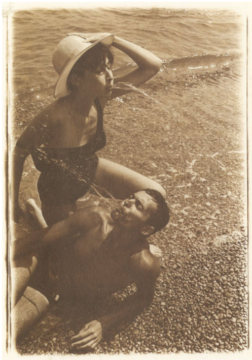
Boris Mikhailov. Crimean Snobbism (Series), 1981. One of a series of 55 photographs, gelatin silver prints, sepia toned, 7 x 5 1/8 inches (18 x 13 cm), edition of 3/3.