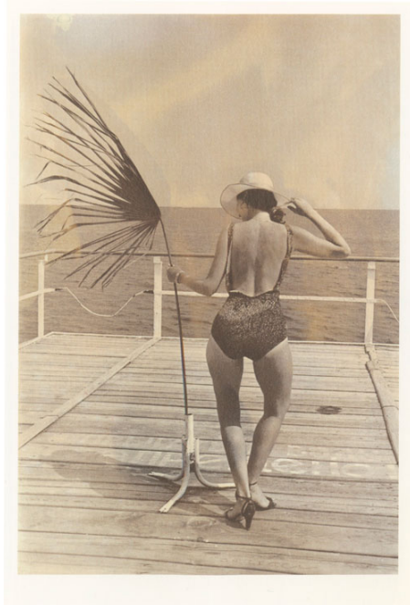
Boris Mikhailov. Crimean Snobbism (Series), 1981. One of a series of 55 photographs, gelatin silver prints, sepia toned, 7 x 5 1/8 inches (18 x 13 cm), edition of 3/3.