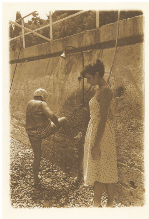
Boris Mikhailov. Crimean Snobbism (Series), 1981. One of a series of 55 photographs, gelatin silver prints, sepia toned, 7 x 5 1/8 inches (18 x 13 cm), edition of 3/3.