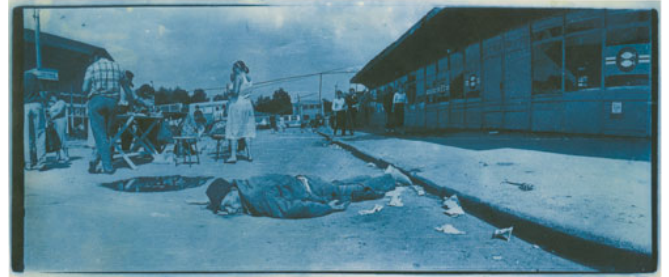
Boris Mikhailov. At Dusk (Series), 1993–2000. One of a series of 110 photographs, gelatin silver prints, blue hand toned, each 5 1/8 x 11 3/4 inches (13 x 29.5 cm).