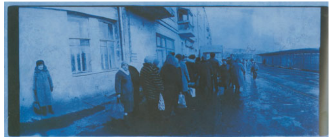
Boris Mikhailov. At Dusk (Series), 1993–2000. One of a series of 110 photographs, gelatin silver prints, blue hand toned, each 5 1/8 x 11 3/4 inches (13 x 29.5 cm).