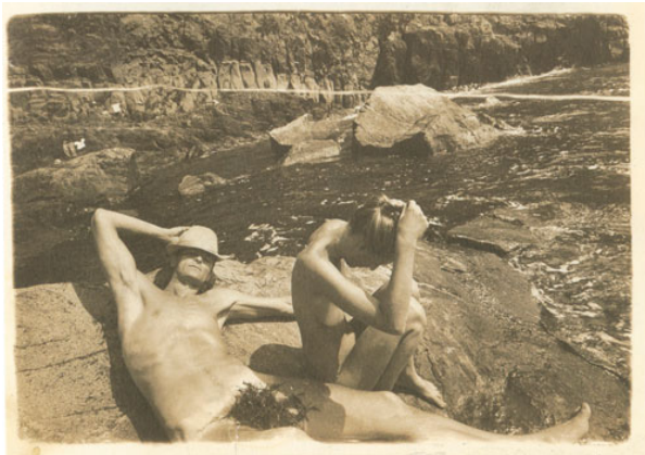
Boris Mikhailov. Crimean Snobbism (Series), 1981. One of a series of 55 photographs, gelatin silver prints, sepia toned, 5 1/8 x 7 inches (13 x 18 cm), edition of 3/3.