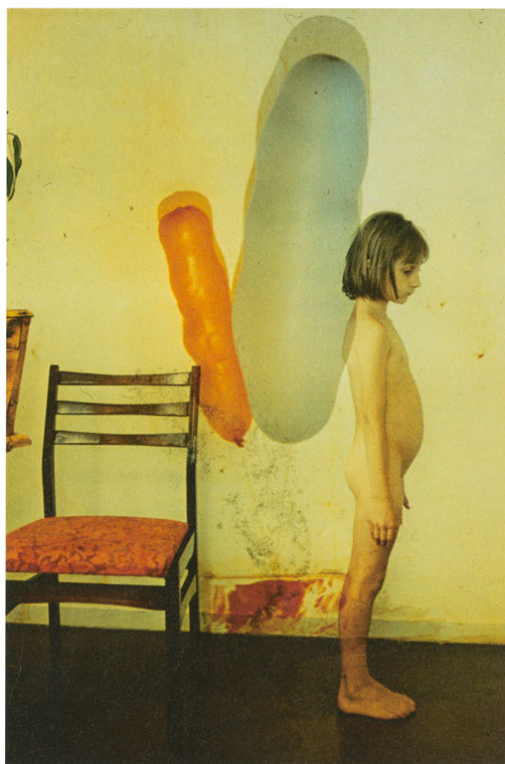
Boris Mikhailov. Untitled. Yesterday's Sandwich (Superimposition series), 1968 – 1975. Chromogenic print, 59 x 39 ¼ inches (150 x 100 cm), edition of 4/5.