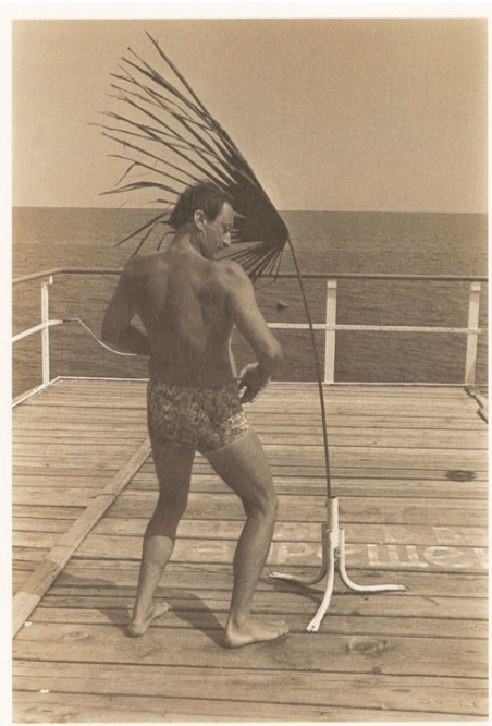
Boris Mikhailov. Crimean Snobbism (Series), 1981. One of a series of 55 photographs, gelatin silver prints, sepia toned, 7 x 5 1/8 inches (18 x 13 cm), edition of 3/3.