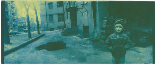
Boris Mikhailov. At Dusk (Series), 1993–2000. One of a series of 110 photographs, gelatin silver prints, blue hand toned, each 5 1/8 x 11 3/4 inches (13 x 29.5 cm).