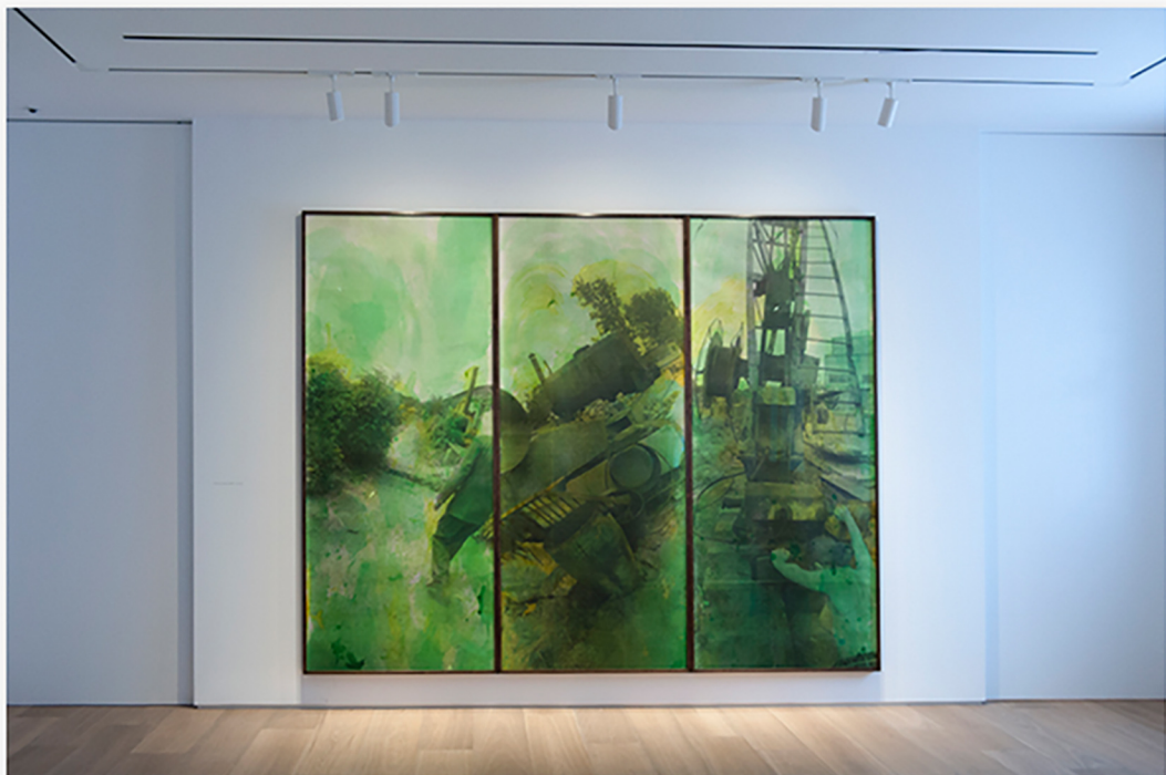
Above: Untitled (Green Series) 1991-1993.