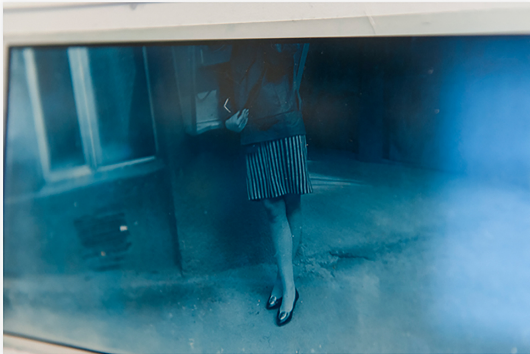
Boris Mikhailov: Four Decades is on view through February 8, 2014.