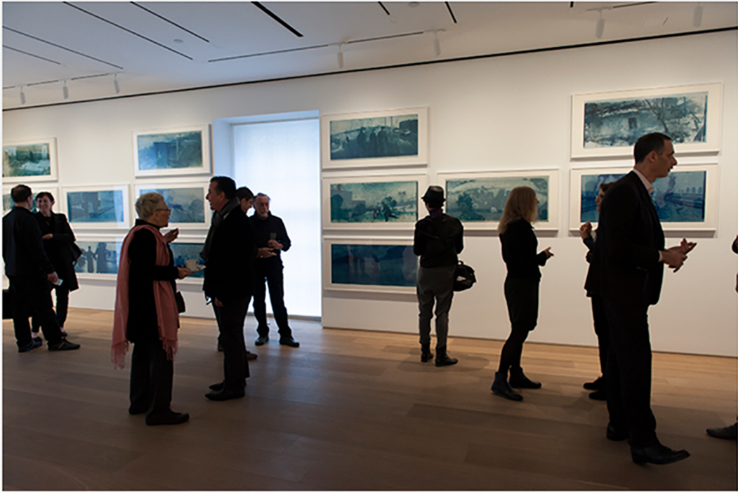
Above: At Dusk , series of 20 photographs, 2000.