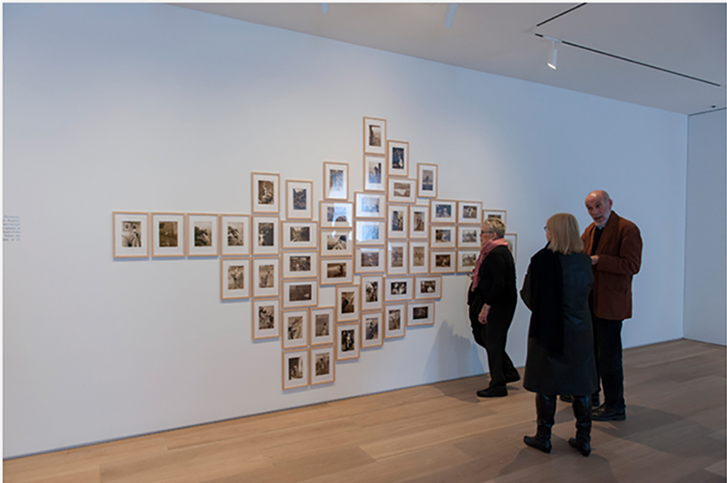
Above: Crimean Snobbism , series of 55 photographs, 1981.