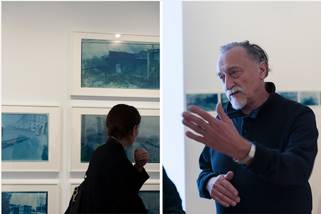
On the right: Photographer Boris Mikhailov.