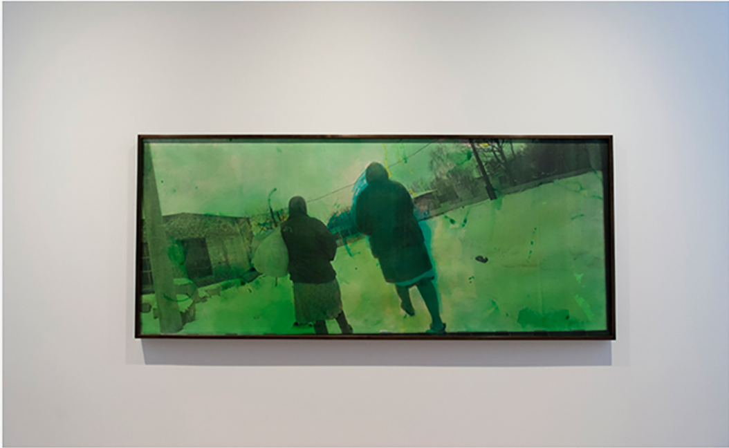
Above: Untitled (Green Series) , 1991-1993.