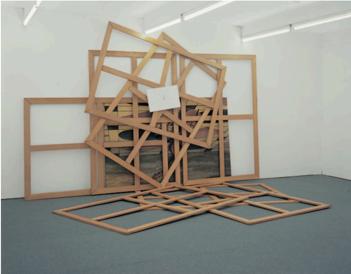
Giulio Paolini, Mnemosine (Les Charmes de la Vie/8) , 1981-90