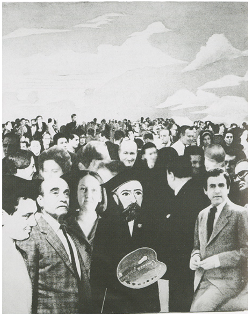
Giulio Paolini, Autoritratto (Self-Portrait) , 1968.

"Hypothesis for an Exhibition" runs through August 16th at Dominique Lévy Gallery in New York.