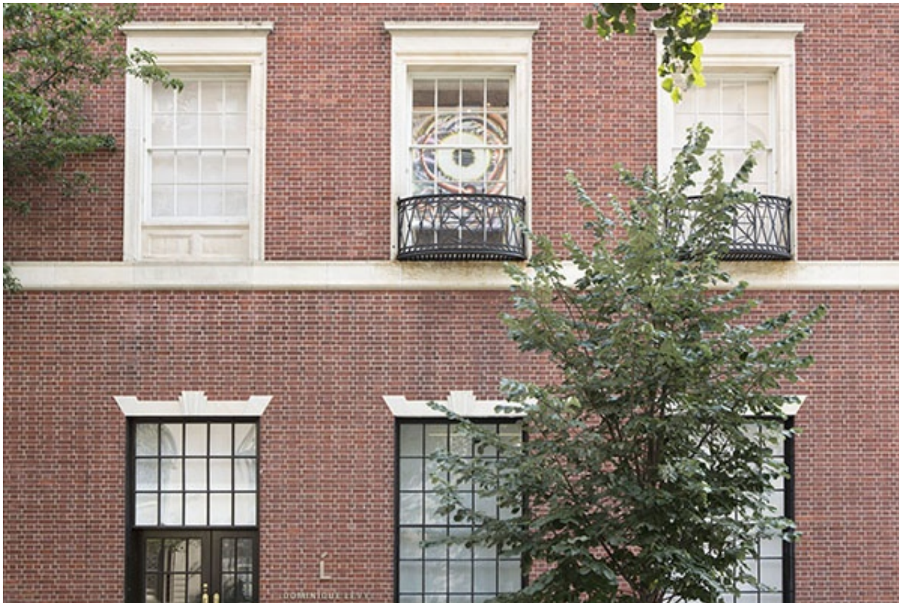
"Hypothesis for an Exhibition" installation views at Dominique Lévy, New York, 2014