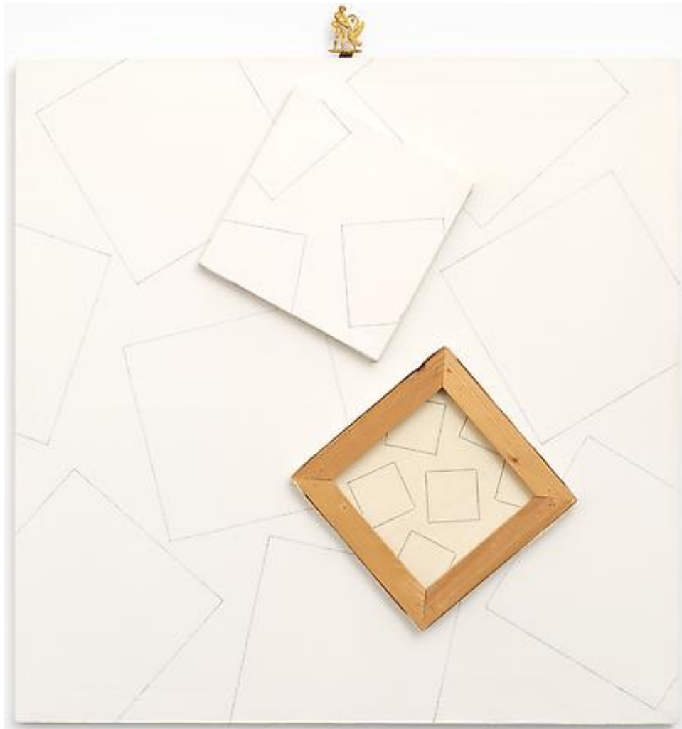
Giulio Paolini, Diapason, 1979– 80 Graphite on canvas, canvas, wood, bronze 106.7 x 99.7 cm