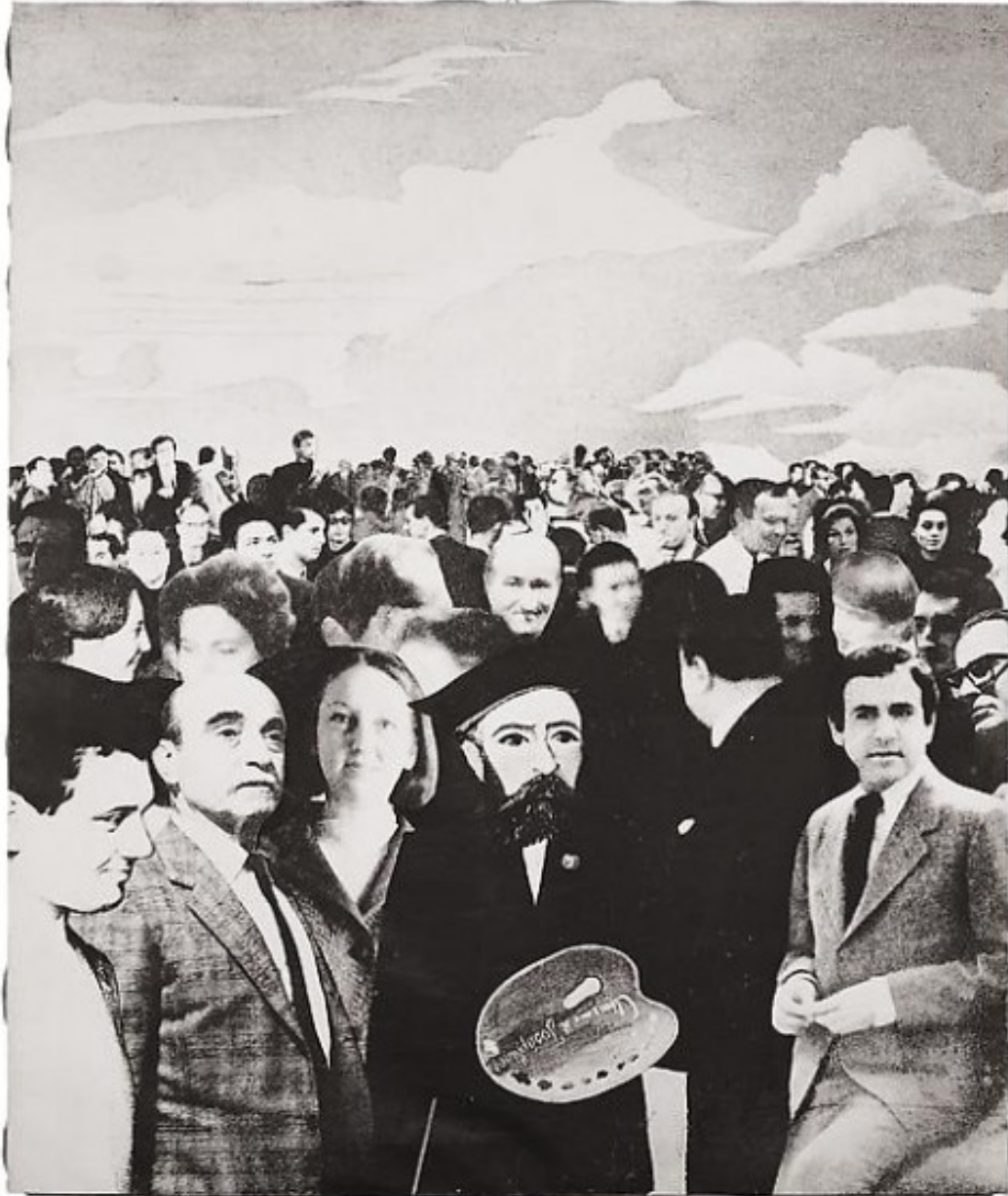
Giulio Paolini, Autoritratto (Self-Portrait), 1968 Photo emulsion on canvas, 151.1 x 126.4 cm

A great show for the iconic American gallery which has announced the opening of a new space in London in autumn 2014.