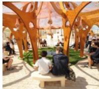
World's Top 20 Biennials, Triennials, and Miscelle...