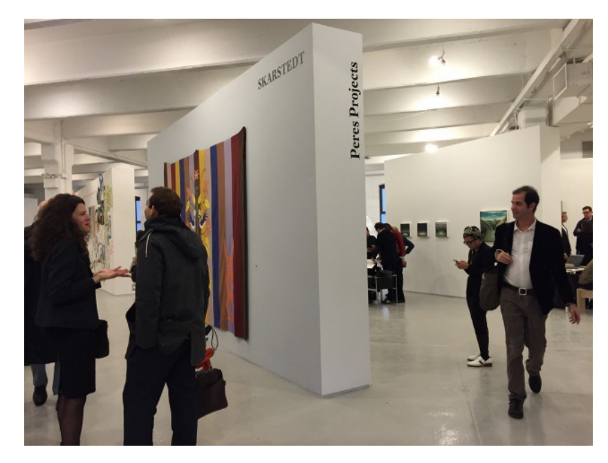
Independent Projects opened to press and collectors on November 5, 2014.

Independent Projects, the second art fair by the folks who brought us Independent, is a little bit of a new kind of beast. But it's also not a total departure from its March sibling. Whether you choose to call it an art fair or not, it is one.