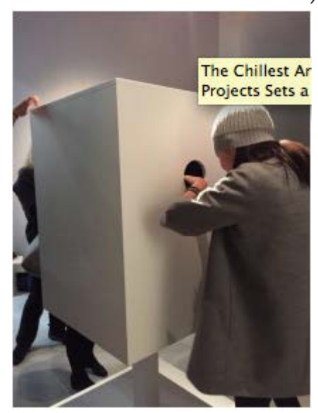
Yves Klein's Sculpture tactile at Dominique Lévy.

But where was the frantic energy we've become accustomed to? Most fair-savvy art worlders build up stamina for the annual events akin to that of seasoned stockbrokers used to the rush of the trading floor. Even the volume of voices was an octave lower than most fairs. The only frenzy to be found was at Dominique Lévy's participatory tribute to Yves Klein. Cries of "It's so gross!" echoed from the small, dark room on the third floor where Sculpture tactile (a work conceived by Klein in 1957 but never realized) was being shown.