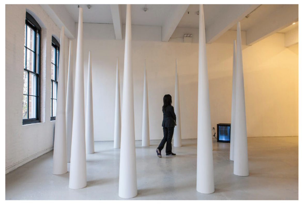
"After Mirage," a multimedia installation by Joan Jonas at Independent Projects.

The art fair has become a primary vehicle for viewing and selling art, but this doesn't mean it's a static form. <u>Independent Projects</u>, a hybrid art fair and exhibition installed in the former Dia Art Foundation space on West 22nd Street in Chelsea, is a welcome mutation. With 40 solo shows, it's a fair this weekend, but on Monday, the gallerists' tables will disappear, and docents (just as in museums) will arrive. Best of all for artists and students, the Independent is free.