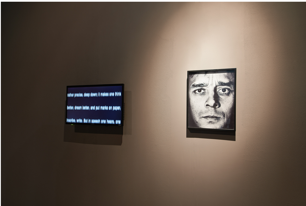
Installation view, The exhibition at Independent Projects by Dominique Lévy