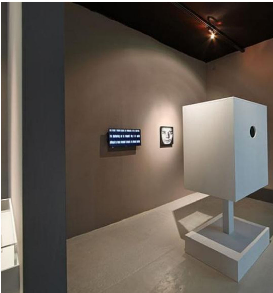
Installation view, The exhibition at Independent Projects by Dominique Lévy