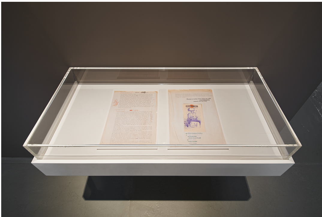
Installation view, The exhibition at Independent Projects by Dominique Lévy