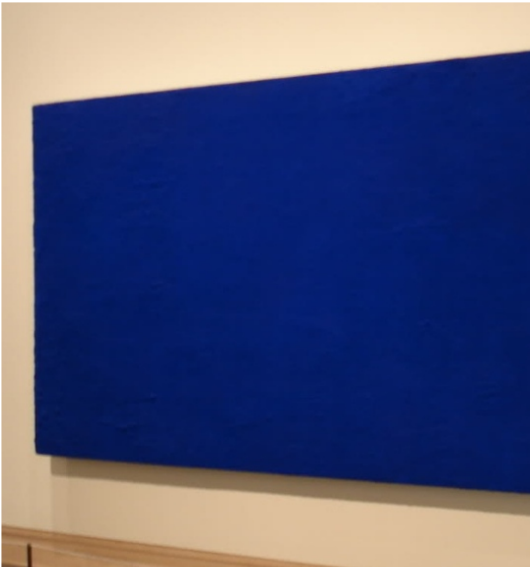
International Klein Blue