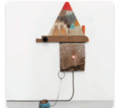
Ropac Brings Rauschenberg Combine to Art Basel