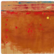
Master Drawings New York Sales Report