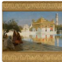
TEFAF New York Fall 2017 Sales Report