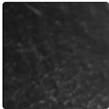
Art Miami Sales Keep Coming