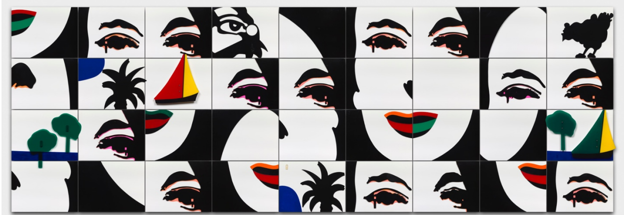
MARTIAL RAYASSE. Dans la suite des tableaux à géométrie variable, ce tableau est en vérité un film d'animation , 1966. Moveable plexiglass elements, 78 3/4 x 228 3/8 inches (200 x 580 cm). Collection S.A la Princesse Catherine Aga-Khan. © ADAGP, Paris and DACS, London 2019.

FIAC Booth C24 17–20 October 2019 Grand Palais Paris