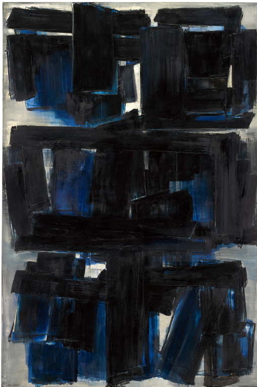
Pierre Soulages. Peinture 195 x 130 cm, 30 octobre 1957, 1957 . Oil on canvas, 76 3/4 x 51 3/16 inches (195 x 130 cm) © 2019 Artists Rights Society (ARS), New York / ADAGP, Paris. Courtesy National Gallery of Art, Washington, D.C.

New York —Lévy Gorvy is pleased to announce Pierre Soulages: A Century , an exhibition celebrating the 100th birthday of France’s foremost living artist through a presentation of works spanning his career from the 1950s to today. On view from September 5 through October 26, 2019, this focused survey explores the artist’s enduring role in the dialogue between European and American painting and invites viewers to consider the impact of a practice that has injected profound poetry into radical abstraction through its adherence to a single material: black paint.