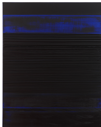
Pierre Soulages. Peinture 92 x 73 cm, 27 février 1989, 1989 . Oil on canvas, 36 1/4 x 28 3/4 inches (92 x 73 cm). © 2019 Artists Rights Society (ARS), New York / ADAGP, Paris. Photo: Elisabeth Bernstein.

While overlapping with Abstract Expressionism, Soulages maintained a resolute independence, insisting that his true language was that of modern art while drawing on a range of earlier sources, from ancient menhirs to Romanesque architecture. Pierre Soulages: A Century will feature several highlights from his important early period, including Peinture 195 x 130 cm, 20 novembre 1956 , a work on loan from the Solomon R. Guggenheim Museum, New York, that was part of the