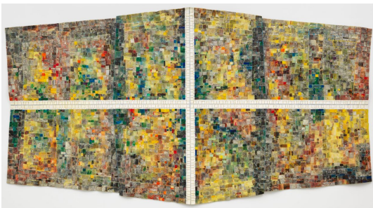
'Mask III: For The Children of Dunblane, Scotland,' a 1996 work by Jack Whitten, the focus of a coming show at Hauser & Wirth.

Powerhouse galleries typically kick off the season with high-profile September shows, but many have pushed back the biggest ones to October or November. On Oct. 14, Levy Gorvy will open a major survey of works by Arte Povera giant Michelangelo Pistoletto , who at age 88 just went back to work after recovering from Covid-19. Hauser & Wirth has a small show of Luchita Hurtado works opening Sept. 10 and plans highly anticipated exhibits of Jack Whitten and George Condo on Nov. 5.