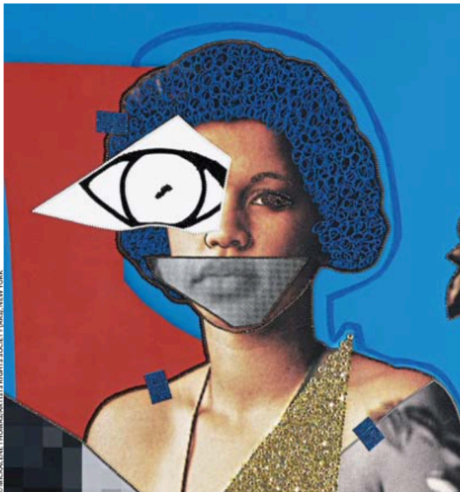
© MICKALENE THOMAS/ARTISTS RIGHTS SOCIETY (ARS), NEW YORK