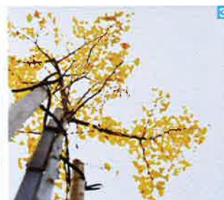
1 The pool deck at SLS Hotel, 2 The New York gallery the Hole is bringing Evan Gruzis's 2008 ink-on-paper Weird Mirror to Art L.A. Contemporary, 3 The L.A. gallery 1301PE is bringing Uta Barth's 2010 photograph Untitled (10,2) to the same fair.