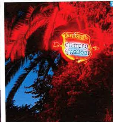
4 Scallops at Campanile. 5 Lucques, in a onetime carriage house on Melrose. 6 Get your dandy on at Paul Smith. 7 The eternally hip Chateau Marmont, in West Hollywood.