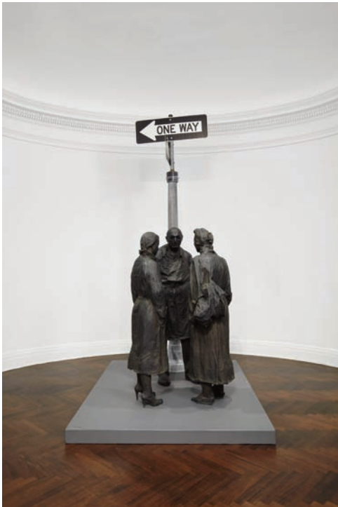
Chance Meeting , 1989

L&M Arts is proud to present an important collection of work by George Segal, on view February 17 - April 3, 2010.