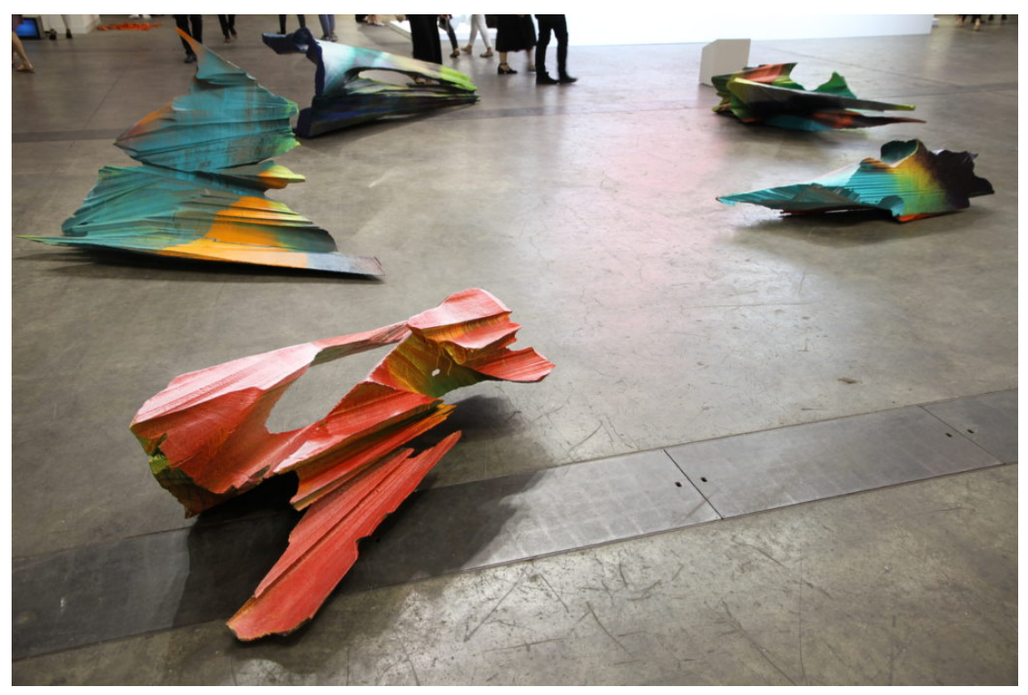
Katharina Grosse Untitled.