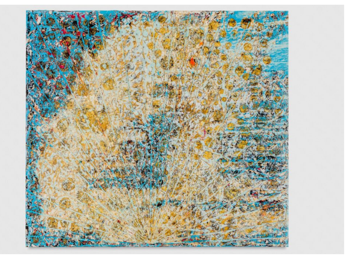
Mark Bradford Water in the Ear Puts Guards at the Gate (2017).