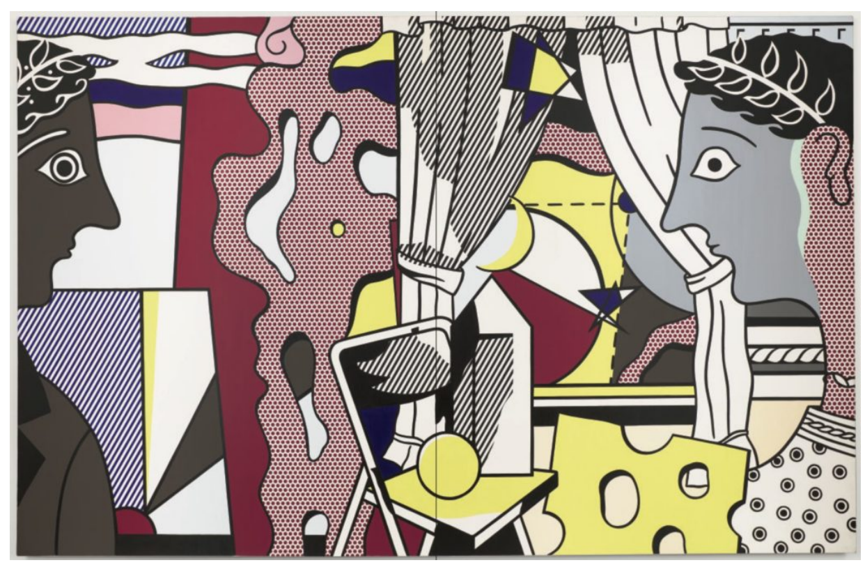
Roy Lichtenstein, Cosmology (1978). Courtesy of Lévy Gorvy, © estate of Roy Lichtenstein/DACS 2017.