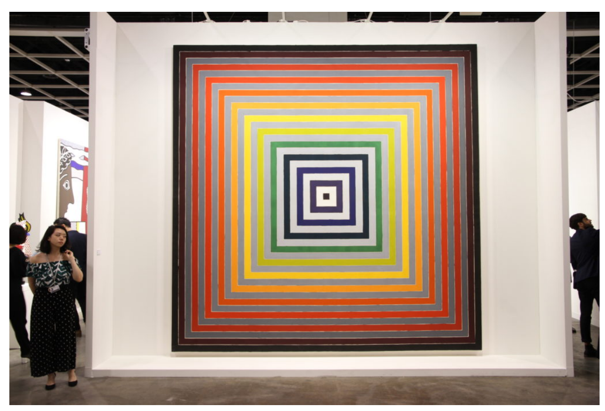
Frank Stella Lettre sur les sourds et muets I (1974).