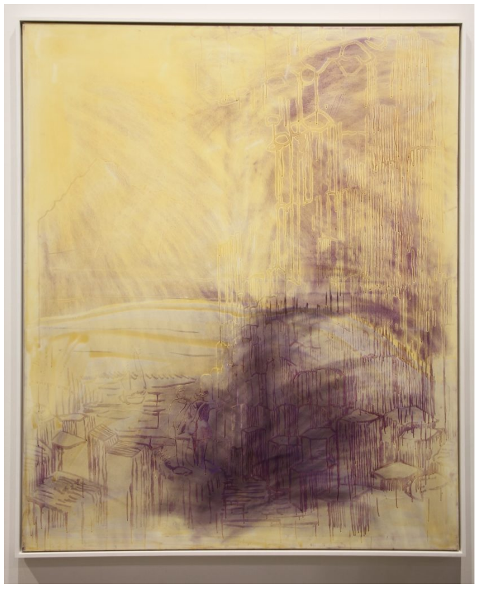
Sigmar Polke Untitled (1982).