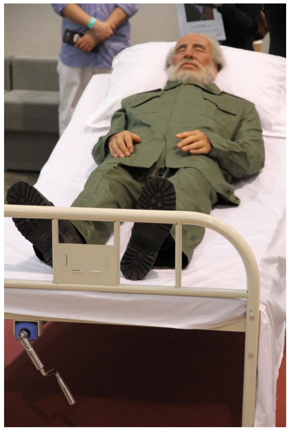
Shen Shaomin Summit (2009-10).