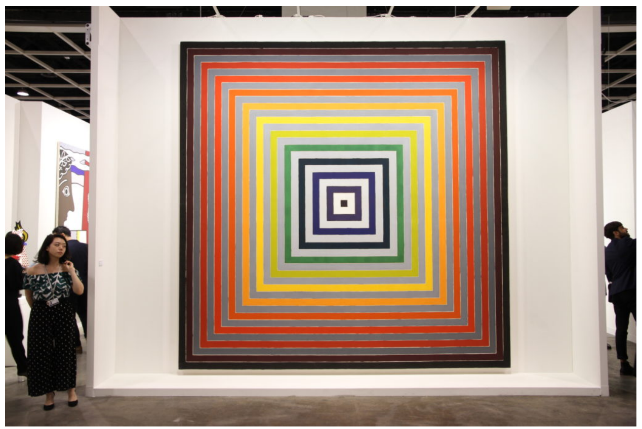
Frank Stella Lettre sur les sourds et muets I (1974).

The fifth edition of <u>Art Basel in Hong Kong</u> started with a VIP preview at the city's convention and exhibition center on Tuesday. With 242 participants, there was an enormous amount of art to take in. Galleries from 35 countries brought offerings from Modern to contemporary and emerging to blue chip.