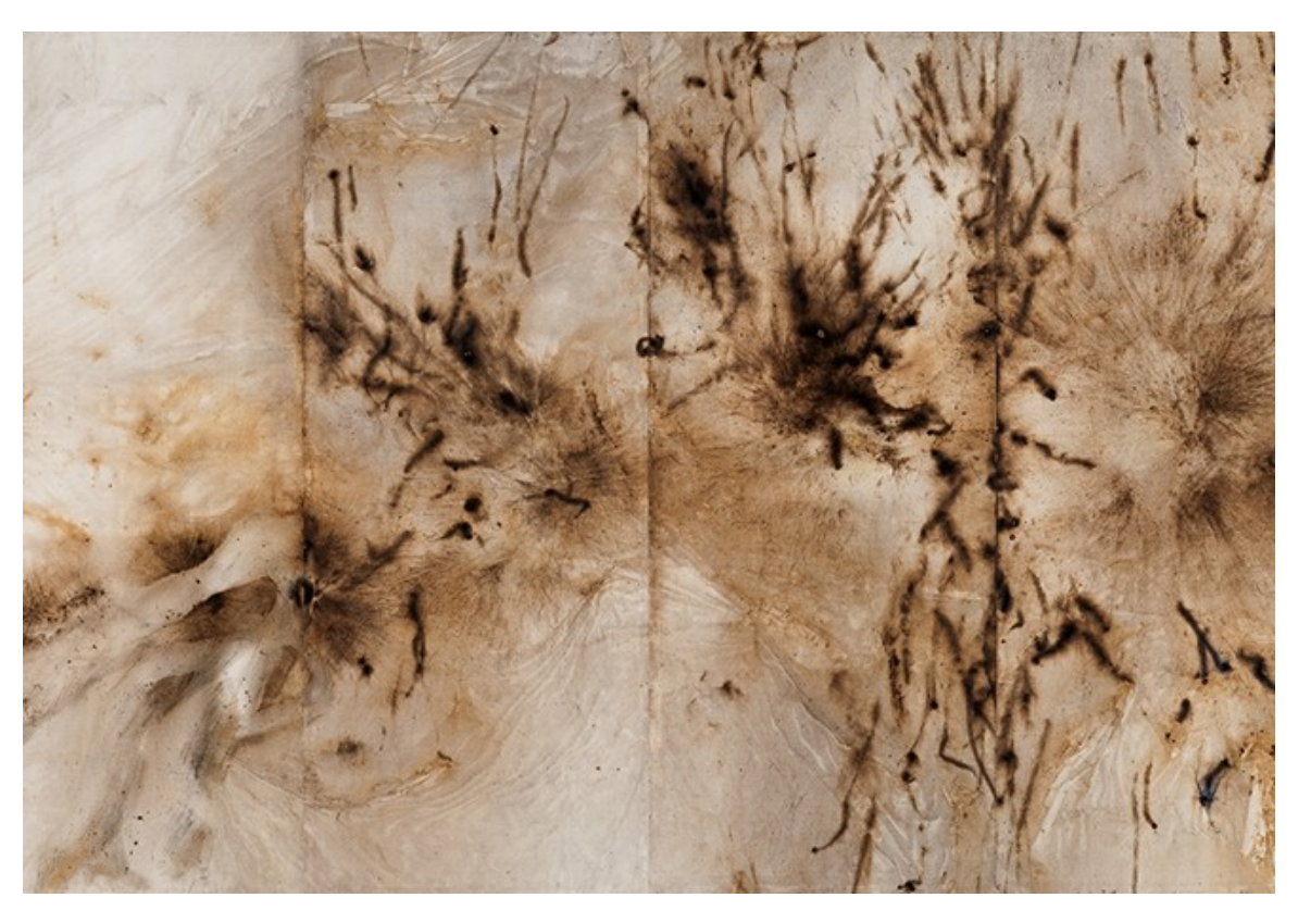
Cai Guo Qiang Toroko Gorge (2009).