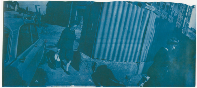
At Dusk series of 20 photographs 2000 chromogenic prints each 24 x 50 3/4 inches (61 x 129 cm) Edition 2 of 3