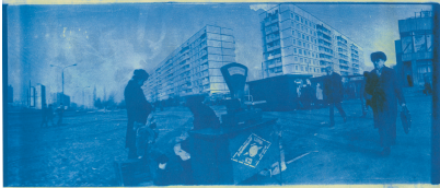
At Dusk series of 110 photographs 1993 gelatin silver prints, blue hand toned each 5 1/8 x 11 3/4 inches (13 x 29.5 cm) unique variations of 5 + 2 AP's