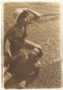
Crimean Snobbism series of 55 photographs 1981 gelatin silver prints, sepia toned each vertical: 7 x 5 1/8 inches (18 x 13 cm) each horizontal: 5 1/8 x 7 inches (13 x 18 cm) Edition 3 of 3