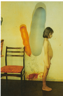
Yesterday's Sandwich (Superimposition series) 1968 - 1975 chromogenic print 59 x 39 1/4 inches (150 x 100 cm) Edition 4 of 5