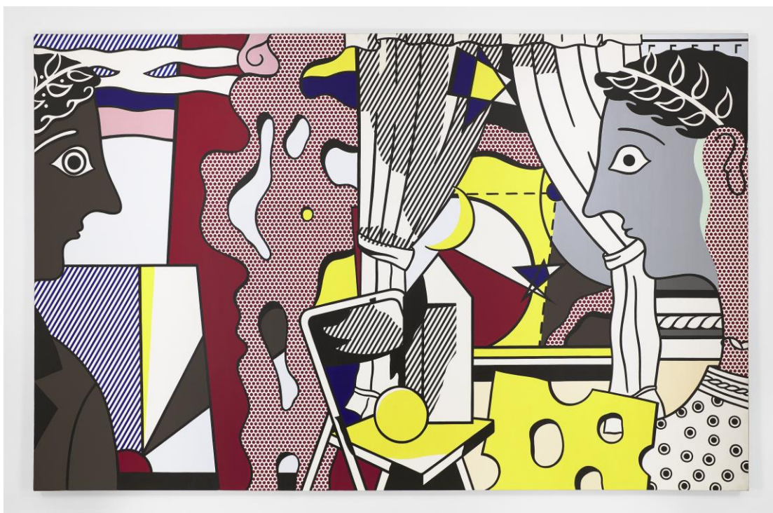
Roy Lichtenstein, Cosmology , 1978. Oil and Magna on canvas, 107 × 167 ½ inches (271.8 × 425.5 cm) © Estate of Roy Lichtenstein/ DACS 2017

Another highlight of the booth is Roy Lichtenstein's Cosmology , 1978. Collapsing various surrealist tropes into a single image, Cosmology is steeped in self-referential markers that trace the progression of Lichtenstein's work. Featuring motifs that hark back to the work of Giorgio de Chirico, Pablo Picasso, and René Magritte, as well as references to earlier periods of Lichtenstein's own career, Cosmology lives up to its title, as the intensely stratified collage of historically loaded and intimately linked forms intermingle in a single image—one that manifests the inception of multiple histories of modern art.