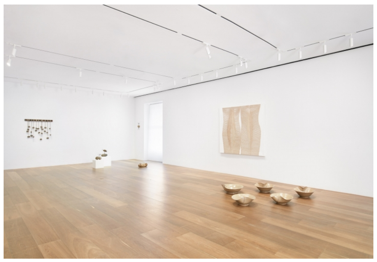
Seung-taek Lee, installation view

ordinary people. This can be seen in the untitled bowls installation (1972/2015), in which Lee pays tribute to those who engage in the rural culture of onggi , through the fermentation of pickled condiments in traditional earthenware bowls. In the exhibition, these bowls have been remade and fired as porcelain, then placed directly on the floor.