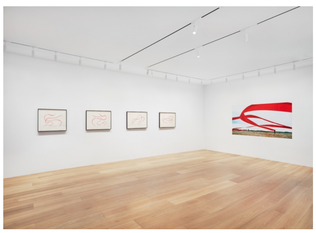
Seung-taek Lee, installation view

Another theme in Lee's work is an interest in the immaterial aspects of nature. One example of this is his three Wind paintings (1972–82), made by attaching wavy lines of rope to each canvas. Lee uses the rope to symbolize ripples created by the wind blowing over water. Wind is again employed in the installation Wind-Folk Amusement (1971), in which three 80-meter strips of red cloth flutter in the windy skies on Nanji Island on the Han River. This is depicted in this show with a series of drawings in pencil and gouache (1971–90), along with a recent video of a re-enactment of the original installation (2015).