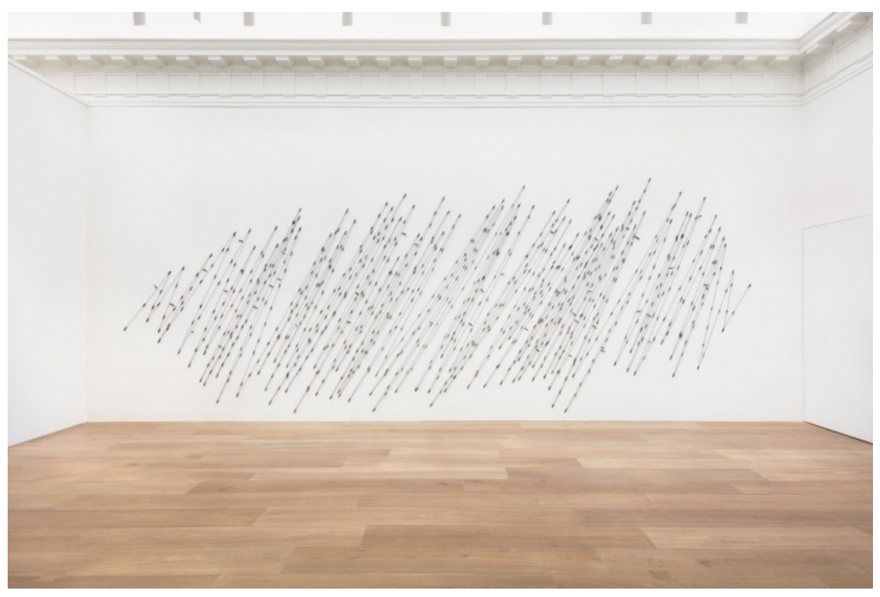
Seung-taek Lee, "Drawing" (1966)

While the avant-garde that emerged in the 20th century is most often seen from the perspective of Europe and the United States, it also arrived in East Asia, particularly after the resounding shock of the Second World War. Asian artists, such as <u>Gutai</u> and <u>Mono Ha</u> in Japan and <u>Dansaekhwa</u> in