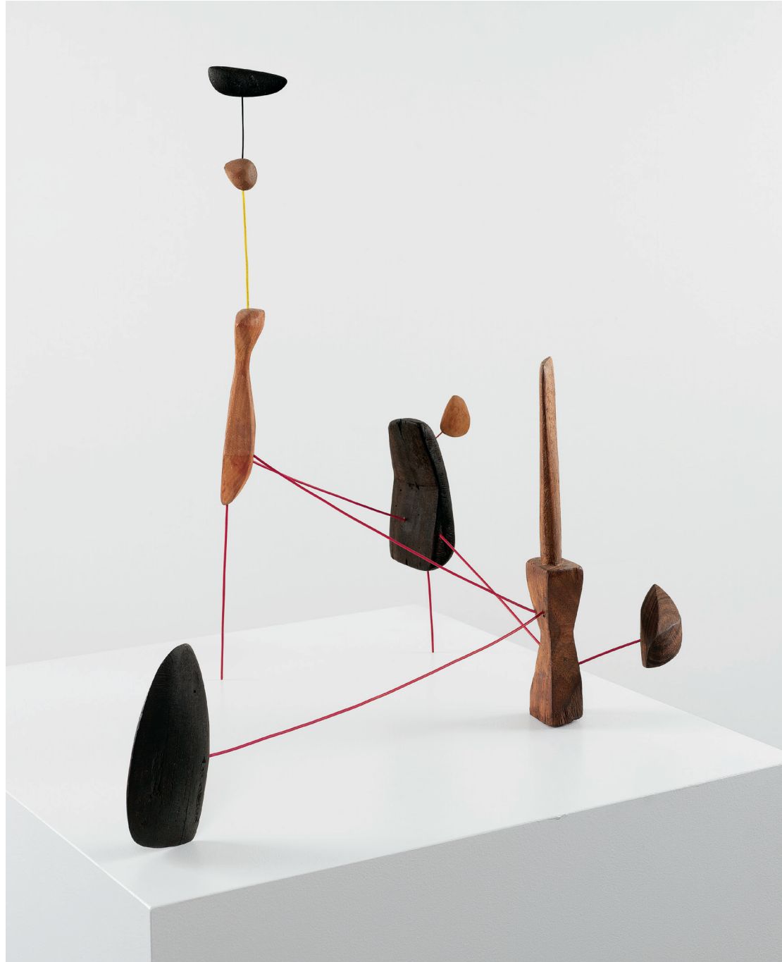
Alexander Calder Constellation with Red Knife , 1943 Wood, wire, and paint 19 x 21 x 15 inches (48.3 x 53.3 x 38.1 cm) © 2010 Calder Foundation, New York / Artists Rights Society (ARS), New York