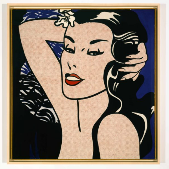
ABOVE Gerald Laing, Rain Check , 1965, Oil on canvas, 48 x 28 inches (122 x 71 cm). © The Estate of Gerald Laing

BELOW Roy Lichtenstein, Little Aloha , 1962, Oil on canvas, 44 x 42 inches (111.8 x 106.7 cm). © The Estate of Roy Lichtenstein